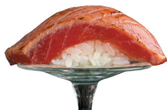
FIRE MAGURO 2 flambéed tuna