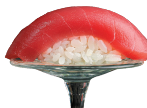
MAGURO 2 tuna