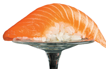
SAKE 2 salmon