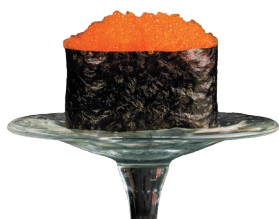
TOBIKO 2 fish roe