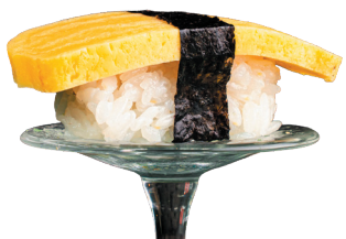
TAMAGO 6 Japanese omelet