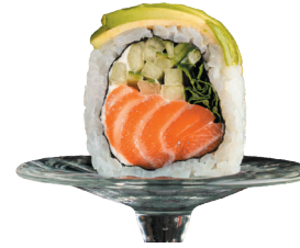
AVO ON LINE

AVO ON LINE 2,5 7 salmon, cream cheese, arugula, cucumber wrapped in avocado