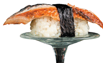
UNAGI 2 freshwater eel