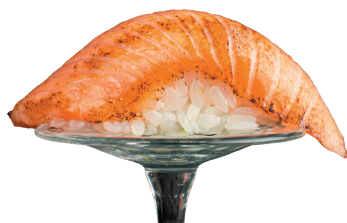
FIRE SAKE 2 flambéed salmon