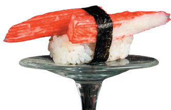
KANI 3 imitation crab meat