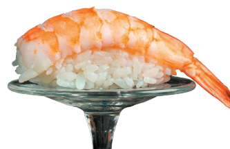
EBI 3 king prawn